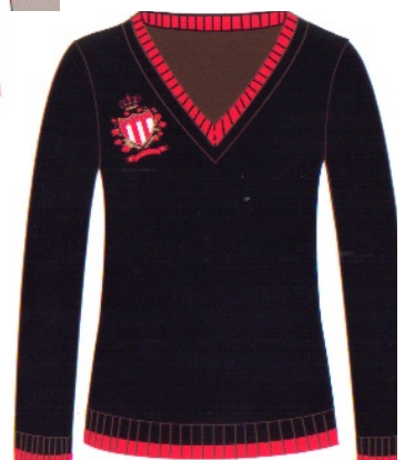
Esperado - Leonie Jumper Grey / red trim Black / pink trim $145.00