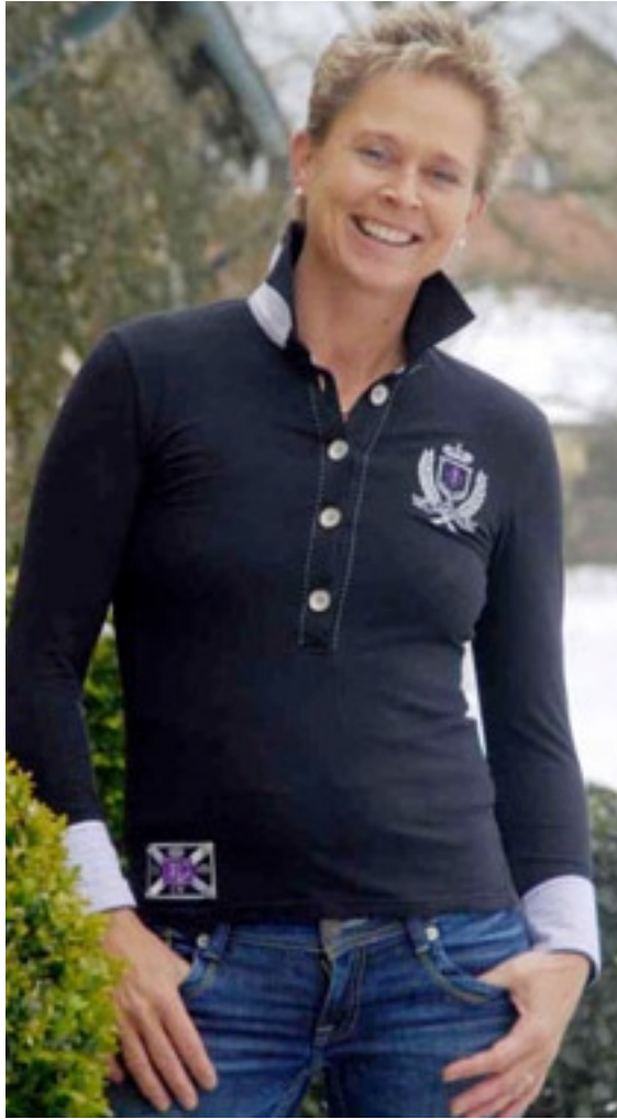
Esperado Renee Casual top