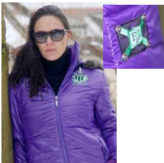
Esperado - Laura Jacket Available in red, purple, black $230.00