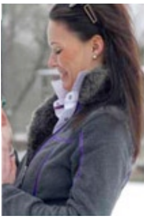
Esperado - Raja Casual stylish shirt.