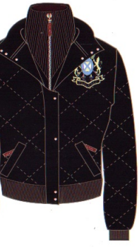
Esperado - Maxim Jacket Red, purple, black $230.00