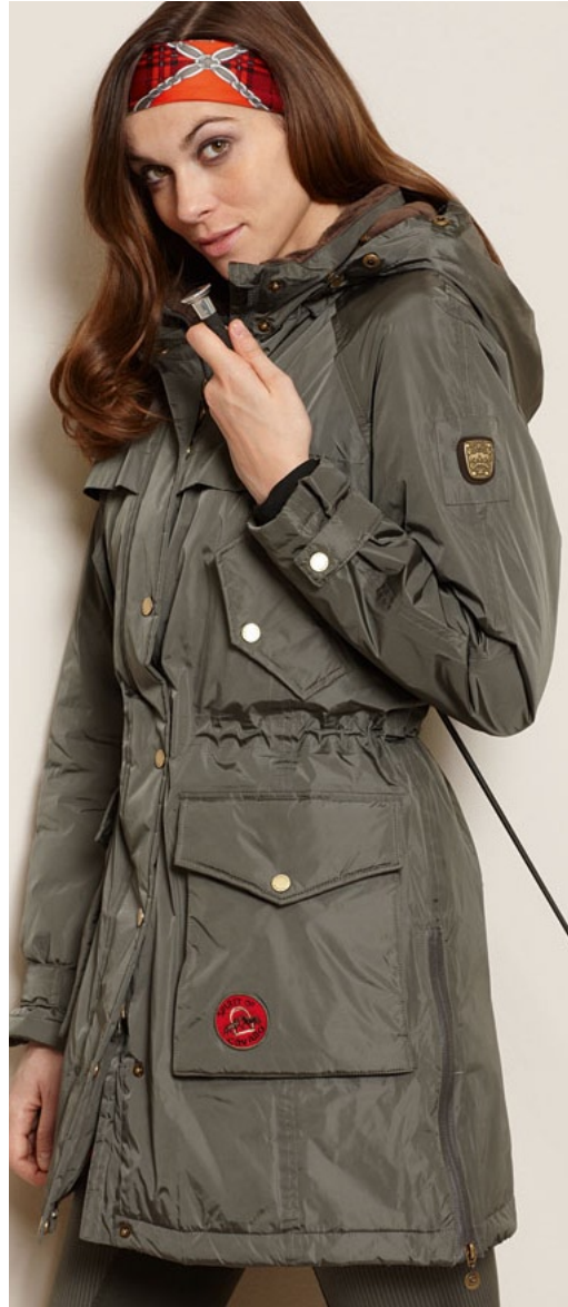
Cavallo Jacket Priscilla

This winter rain jacket with removable hood impresses with its comfortable and warm fleece lining and water repellent seams. The adjustable waist fastener makes for a sleek silhouette and the long back vents ensure a comfortable position in the saddle.